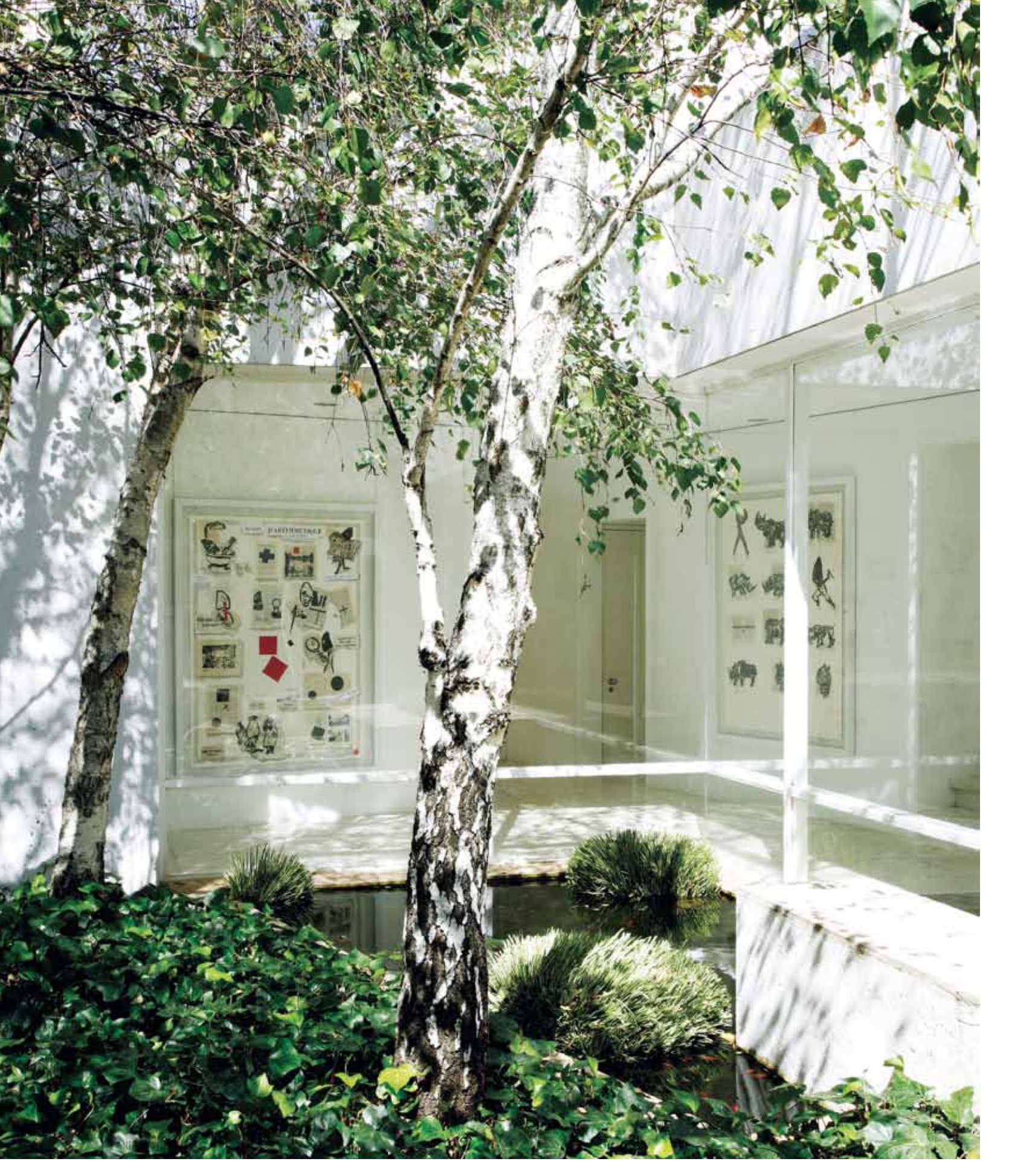
ABOVE A calming koi pond occupies a corner of the vigorously textured garden where the passageway to the bedrooms and entrance hall converge OPPOSITE PAGE In the private sitting area, coir flooring provides a textural contrast to the minimalist furniture. In the background, an antique African pot sits atop a coffee table